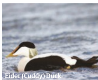
Eider (Cuddy) Duck