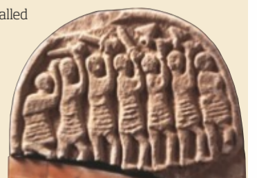
Right: Viking Raider stone from Lindisfarne Priory