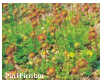
Pirri Pirri bur