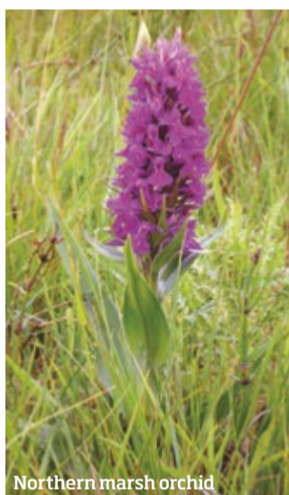
Northern marsh orchid